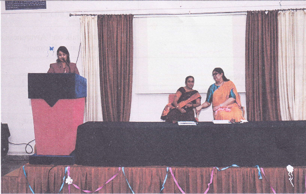
Photo during welcome speech